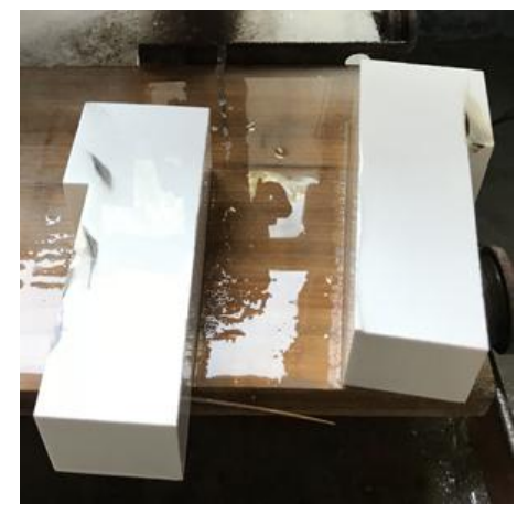
After cutting of finished ceramics

This way can meet the flexible demand in your install or repair process. You can cut it at your workshop.