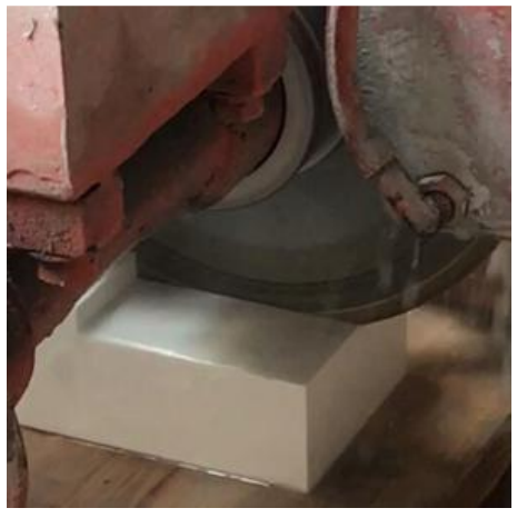
Finished wear resistant ceramics cutting